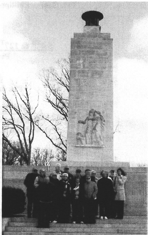
President Franklin D Roosevelt dedicated The Eternal Light Peace Memorial on Oak Hill near Gettysburg on July 3, 1938