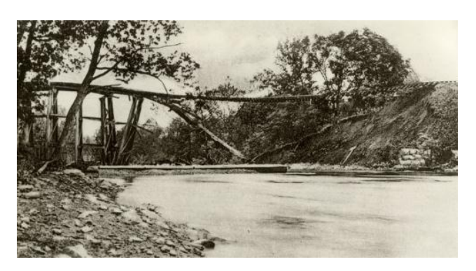
Suffern railroad trestle destroyed during the flood of 1903