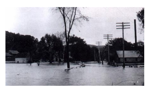
West Nyack Swamp flooded during the flood of 1903