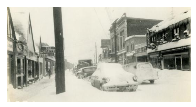
Snow storm in Suffern, NY in the 1950s