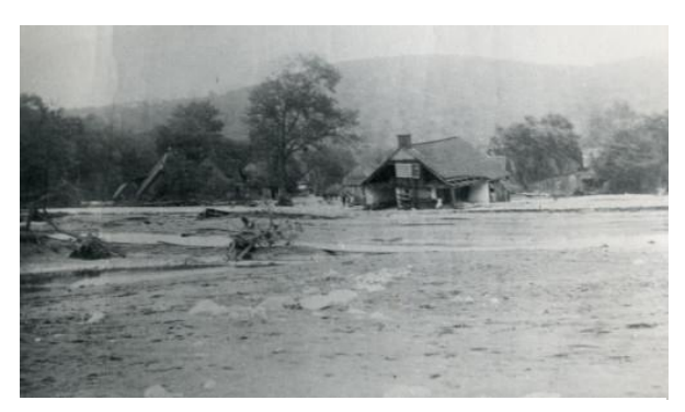
Ramapo Village during the flood of 1903 October 11, 1903