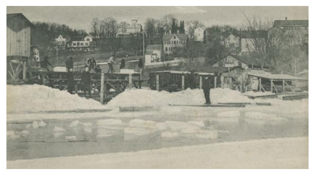
Ice cutting at Rockland Lake