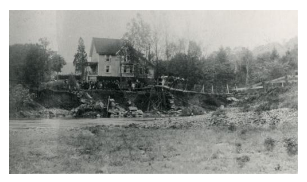
Hillburn Bridge during the flood of 1903 October 11, 1903