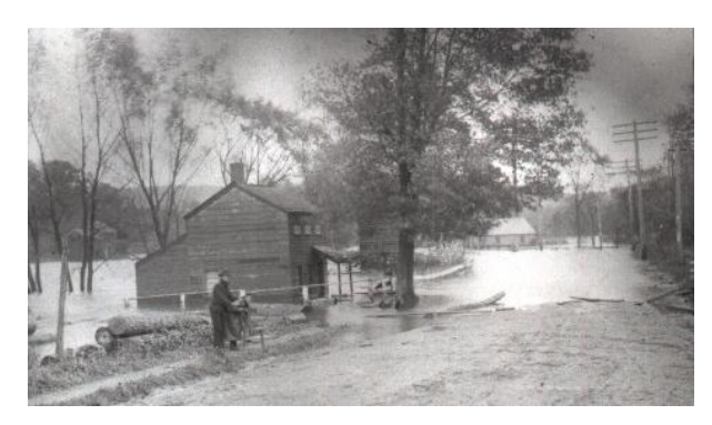
The Hunt house on Nyack Turnpike in West Nyack during the flood of 1903