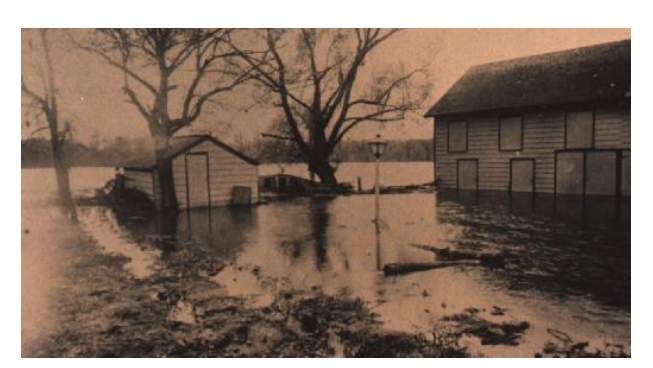
Clarence Campbell's barn on the turnpike in West Nyack after the flood of 1903