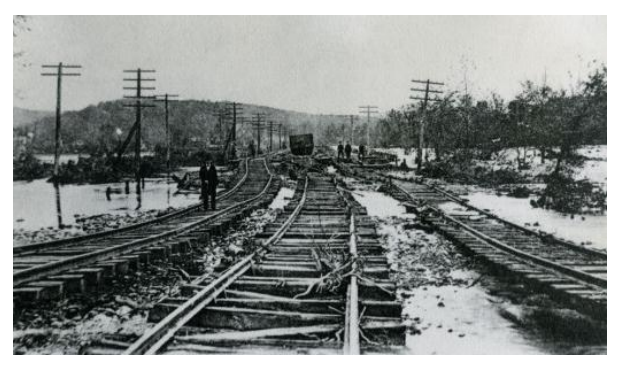
Erie Railroad tracks west of Suffern after the flood of 1903