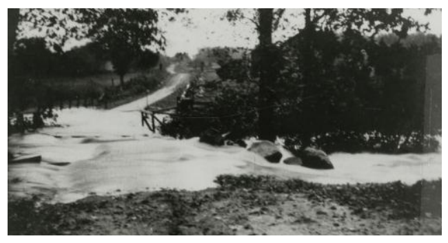
Old Mill Road (now Townline Road) in Nanuet during a flood